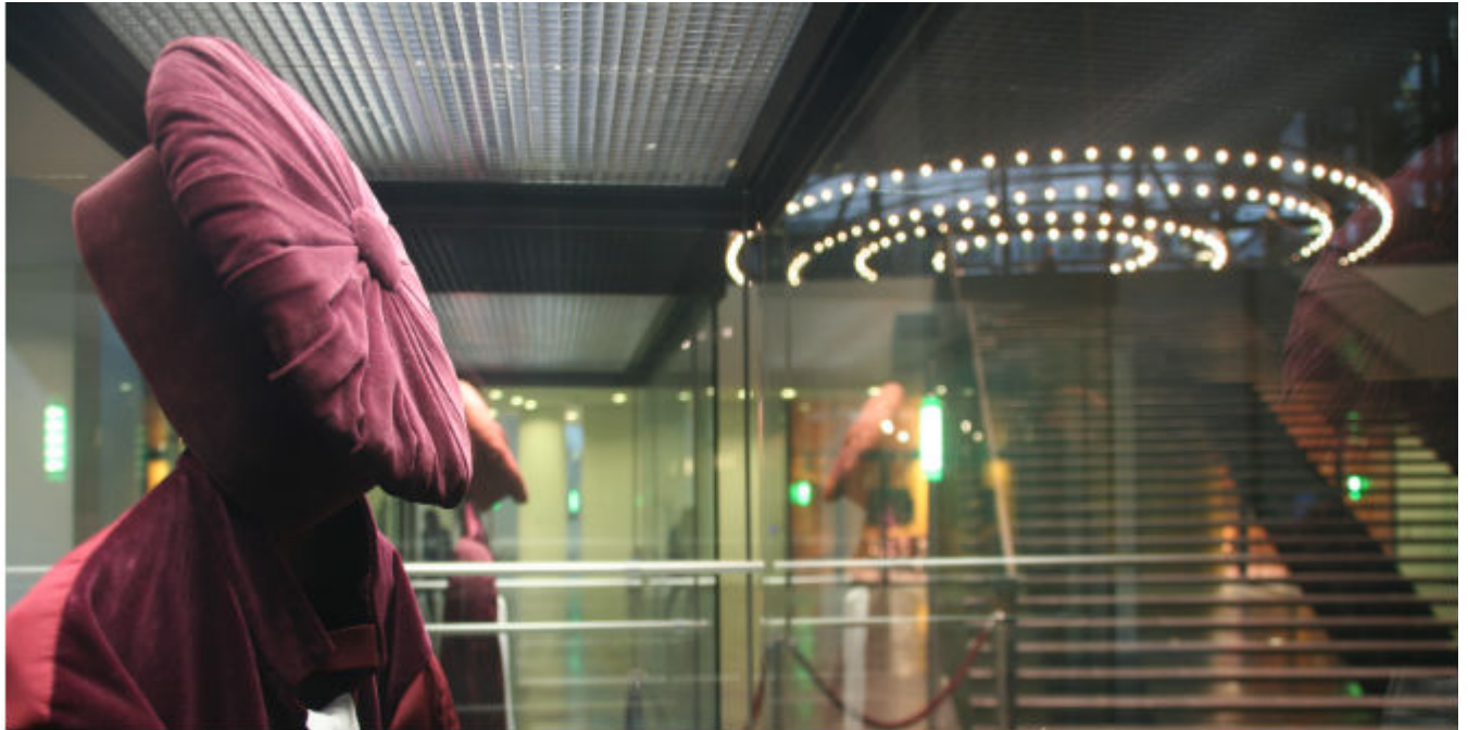
The lobby of the European Court of Justice.

Parliament can always turn to another. The Netherlands proposals emphasise the need for a clear legal base before joint EU action is proposed. Taken individually and together, these areas raise rather fundamental questions about the distribution and exercise of powers in the EU. However, the Netherlands government suggest they can be addressed without Treaty change.