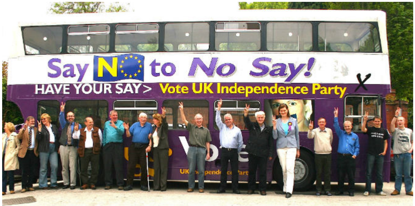
West Midlands Ukip campaigners and their battlebus in 2009.

It seems unfortunate that David Cameron has sought to voice British concerns about the political structure of the EU using the peculiarly British terms of 'sovereignty'. Of course this choice of language reflects the British convention that long-standing (but perhaps not now so applicable) UK view that the Westminster parliament is sovereign in the broad sense of having the final say on all matters of British legislation – including (still) arrangements for regionally devolved and local powers in the UK. According to this account, Parliament is the unique source of the powers of institutions that have public authority in the UK and of the rights of citizens.